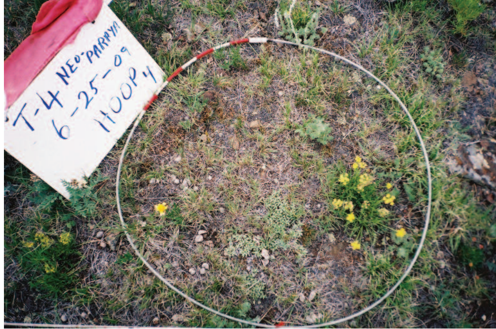
Ground hoops are used to confine small areas that are photographed repeatedly over time to document progress.

"There's really good knowledge available regarding how rangelands can be managed to optimize their potential," Orchard says. "People are using grazing management to hold