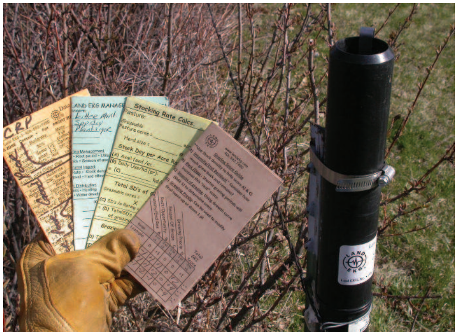
One of Land EKG’s tools is a report card that provides rangeland managers with a checklist of information necessary for effective evaluation of grasslands.

“Recorded scores serve as an extremely effective way to not only historically rank grazing in each pasture, but also provide ‘answers’ for management options to improve the score,” Orchard says.