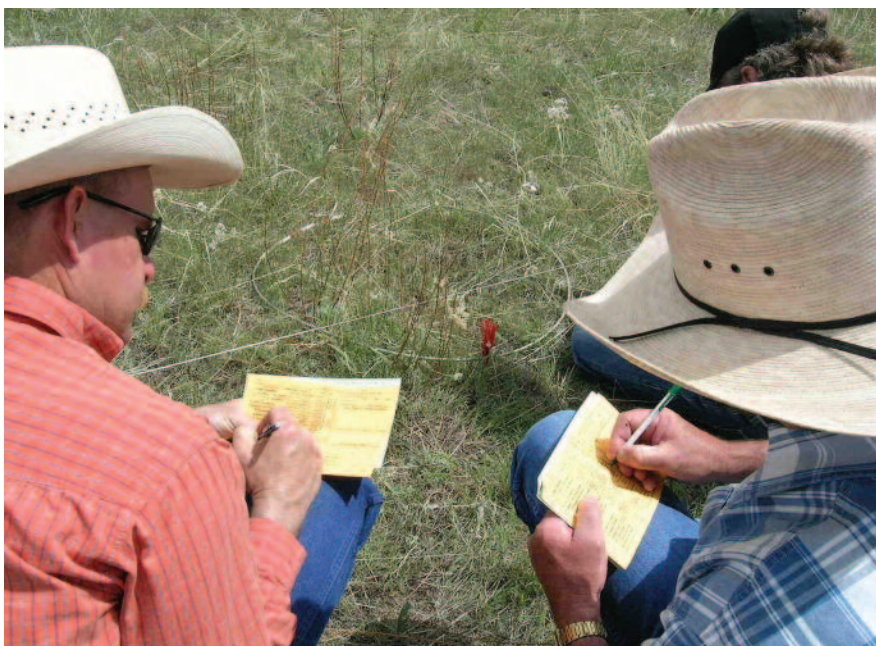
Land EKG Monitoring provides simple guidelines for gathering rangeland data and interpreting the information to help create grazing strategies.

Part of the information gathering process includes establishing permanent line transects or photo stations. Ground hoops are used to confine small areas that are photographed so the images can be used for future comparisons of forage and soil quality. Up to six photos per record can be stored.